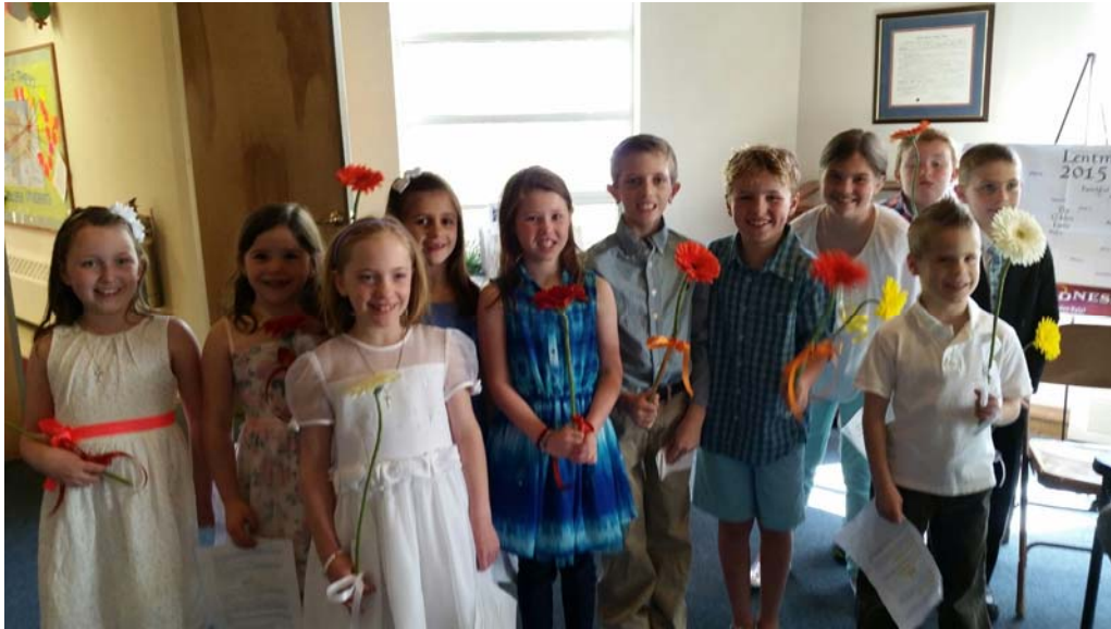
The 1st-3rd grade Sunday School students completed a six week special program called Welcome to Communion, which culminated in a celebration on April 26th. Congratulations!