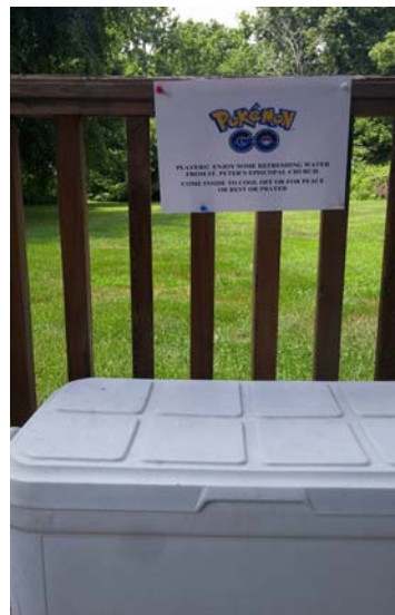
Right: Cooler of drinks in the gazebo for Pokemon Go players