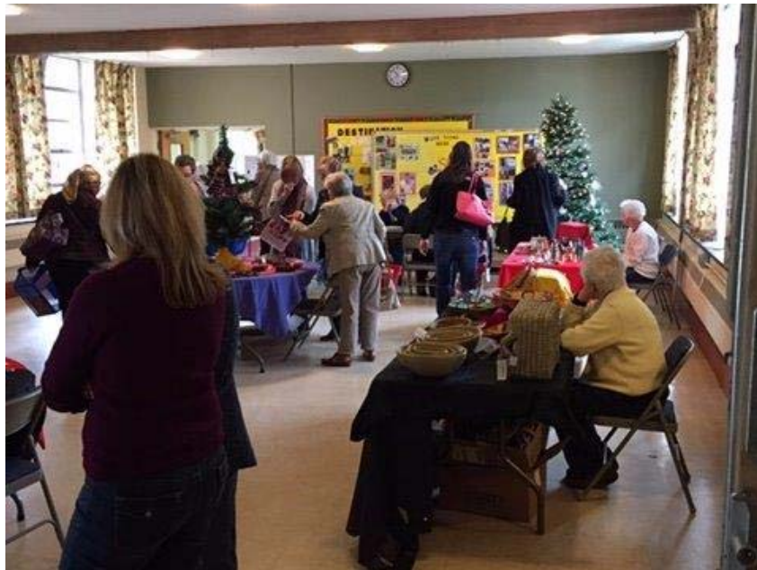
Last year's International Gift Market