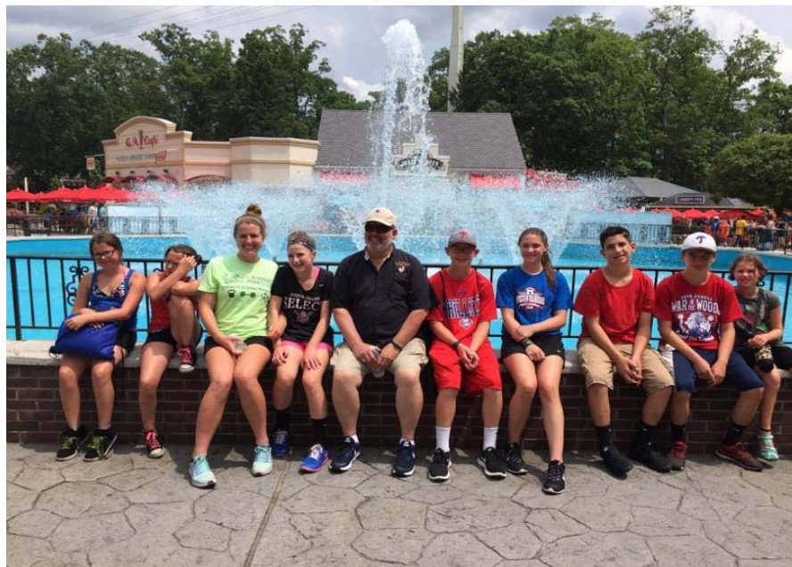
Acolyte Trip to Great Adventure, July 1st

And you, of tender years, Can't know the fears that your elders grew by, And so please help them with your youth, They seek the truth before they can die. Teach your parents well, Their children's hell will slowly go by, And feed them on your dreams The one they picks, the one you'll know by. Don't you ever ask them why, if they told you, you will cry, So just look at them and sigh and know they love you.